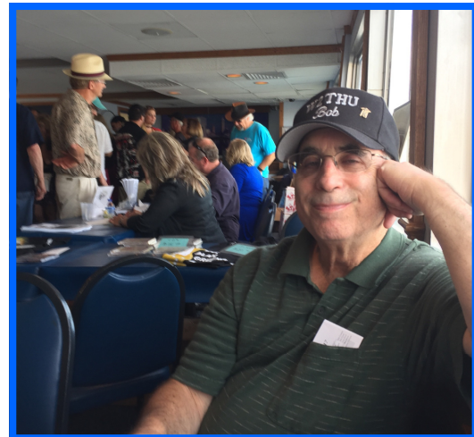
WHY I WASN'T AT THE WINTER LUNCHEON (STAYING WARM IN FLORIDA)

The QCWA annual meeting is traditionally held at the Dayton